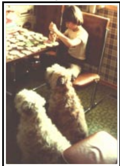
Hoping for cookies