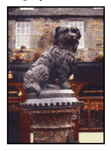
Greyfriar Bobby's Monument