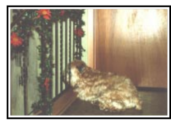
Watching for Santa