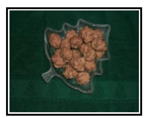
Easy Dog Treats

Avoid hanging edible decorations on the tree. Strings of popcorn or chocolate decorations are too tempting to most dogs! Use only nontoxic tree-water preservatives or artificial snow. Keep electrical cords and batteries out of reach of curious pets. Remember that poinsettias, azalea, holly, ivy, and mistletoe are poisonous plants. Dogs can get sick or even die if they eat them.