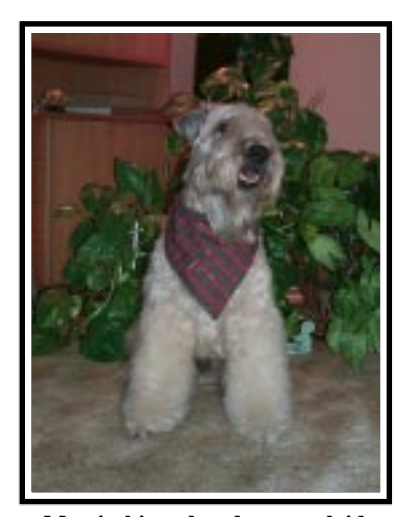
Max in his red and green plaid Christmas bandana

Cut a square of favourite Christmas fabric 53 cm. x 53cm (21" x 21") if you wish to hem your bandana. Cut it 51cm. X 51 cm. (20" x 20") if you wish to use pinking shears to create an INSTANT bandana. To make the hem, press under a 1/4 inch hem allowance, then again a further 3/8 inch on all edges. Stitch hem in place. Fold in half to create a triangle and tie around Wheaten's neck. If you have a puppy or a Wheaten smaller than 42 pound Max you may need to start with a smaller square.