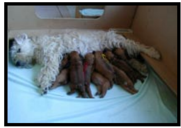
It's getting crowded at feeding time.