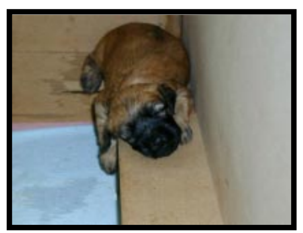
A place of one's own.