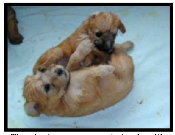
There's always someone to tussle with.