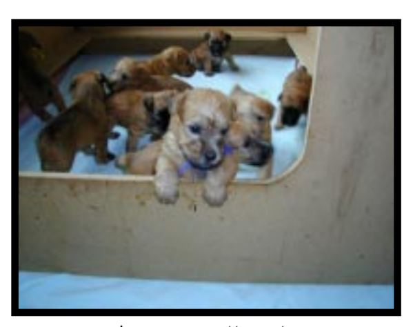
An escape attempt.