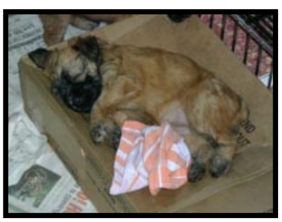
This box makes a great bed.