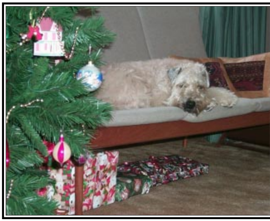
Waiting for Santa's Arrival