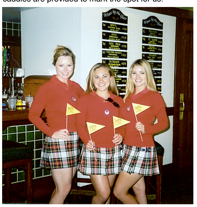
Photo below: Kananaskis is providing a new set of proximity markers in 2008. Sadly, the markers can't be placed on the surface of the greens, so these caddies are provided to mark the spot for us.