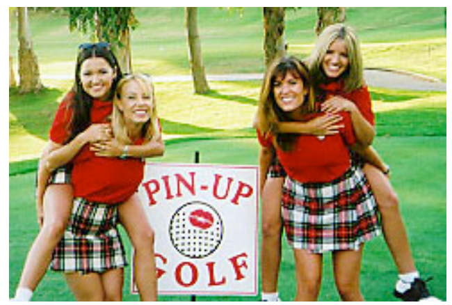
Photo below: There is fear that wet conditions will prevent us from using standard golf carts at the GASP this year. The course will be providing this alternate form of transportation if necessary.