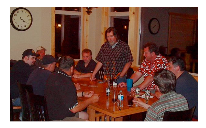
Photo below: Like the 24 Hours of Le Mans, the GASP goes all day, and sometimes, all night. These dedicated golfers are not prepared to give up their tee off time to gamble, at least not when you can give up sleep instead!

Cartoon: Lyle and his computer at RONA just before the GASP (or anytime, when you think about it).